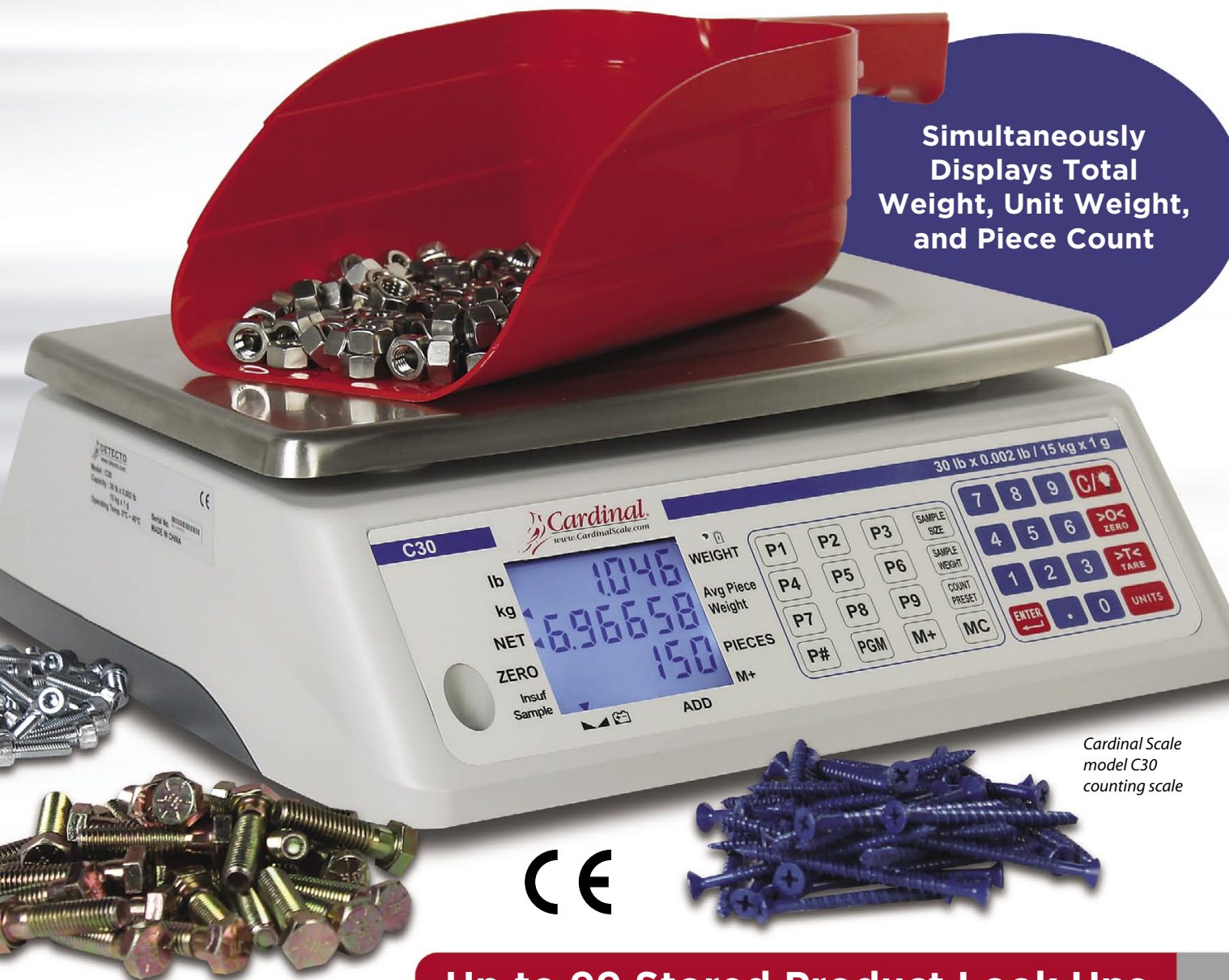
Cardinal Scale model C30 counting scale

Simultaneously Displays Total Weight, Unit Weight, and Piece Count