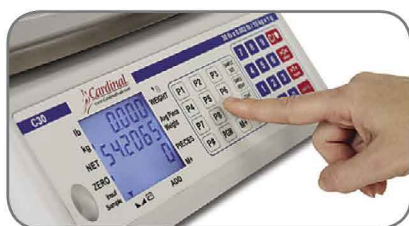
Product look up preset keys speed counting operations

Cardinal Scale's C30 and C65 scales with rechargeable battery are ideal for inventory counting where mobility is a must! These durable counting scales feature a full keypad to enter and recall known piece weights and tare weights, metric conversion, large backlit single LCD, bubble level, and non-skid feet for stability.