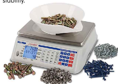
Quickly count multiple inventory parts with ease