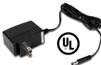
AC adapter included (UL listed for the U.S. and Canada)