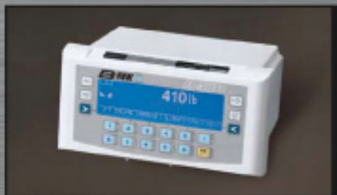
D410 Digital Indicator