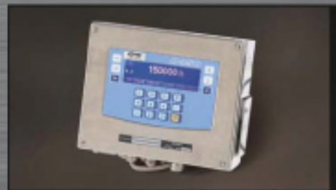
D450 Digital Indicator