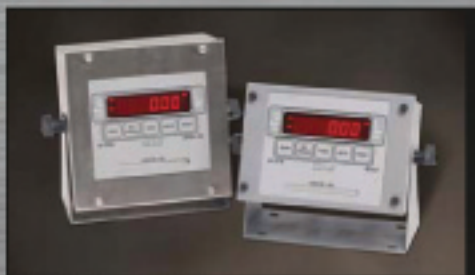
BT84-XL and BT84 Indicators