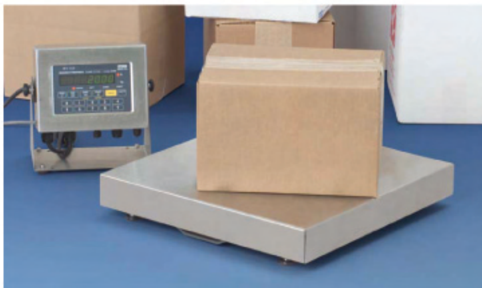
3735LP model shown with optional Avery Weigh-Tronix WI-125 indicator.

Agencies – NTEP Pending (5,000 divisions Class III, C.O.C. # 02-069), U1/CUL