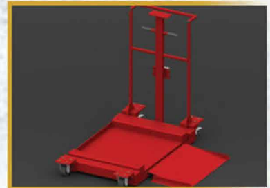
Wheel portability kit