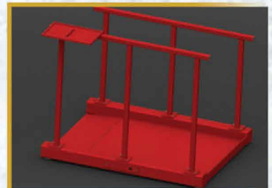
Patient wheelchair scale