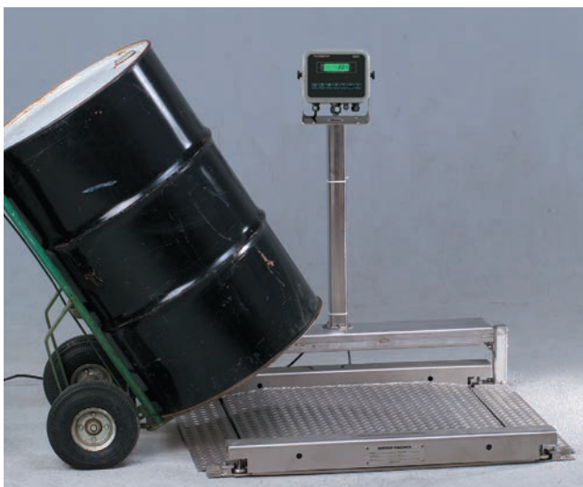
Stainless steel with optional indicator bracket