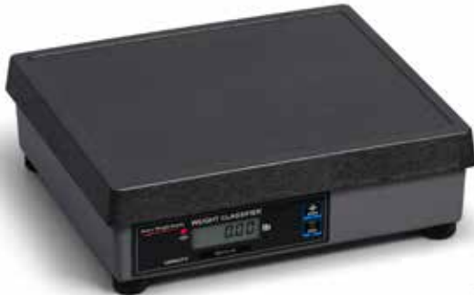
Model 7815 shown with six-digit LCD internal display