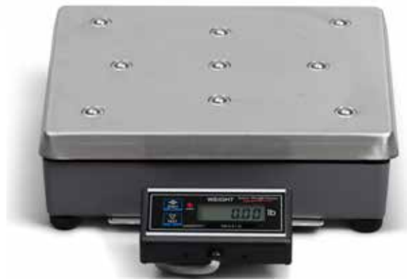
Model 7815R shown with standard 7" remote only