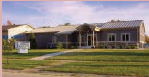
American Scale Corporate Offices, Louisville, KY

Founded in 1985, American Scale Corporation provides industrial scale products, service and calibrations. We are a full service regional distributor for many major manufacturers, including; Avery Weigh-Tronix, B-tek, Rice Lake, Ohaus, Sartorius, Fairbanks and several others. ASC provides outstanding service and quality products to a long list of satisfied customers in the Kentucky and Southern Indiana areas.