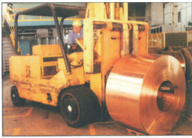
Heavy Duty Bar Mount Applications