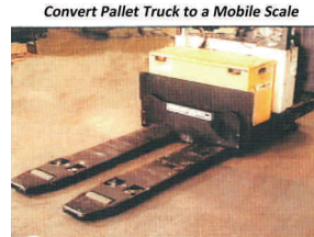
Convert Pallet Truck to a Mobile Scale